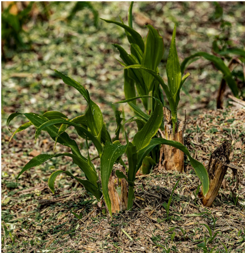
Will this plant kill cattle? This tender regrowth of forage sorghum can be very toxic to cattle if grazed in quantity. Often confused with nitrate toxicity, cyanide toxicity is a potential problem with all sorghum species, including johnsongrass.

So, what do you think? Easy? Hard? My students had a bit of a problem with it the first time (just might have been the instructor, I am afraid). Here are the answers and some explanations.