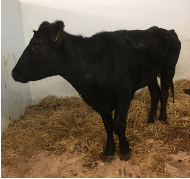
Figure 1: Cow with signs of Johne's disease; dull hair coat, profuse watery diarrhea and weight loss.

Obviously, death loss and premature culling will mean higher replacement costs to keep herd numbers stable. Perhaps less obvious is that MAP-infected cows showing no evidence of disease are less fertile and produce less milk, resulting in lighter calves at weaning and more open cows at pregnancy check.