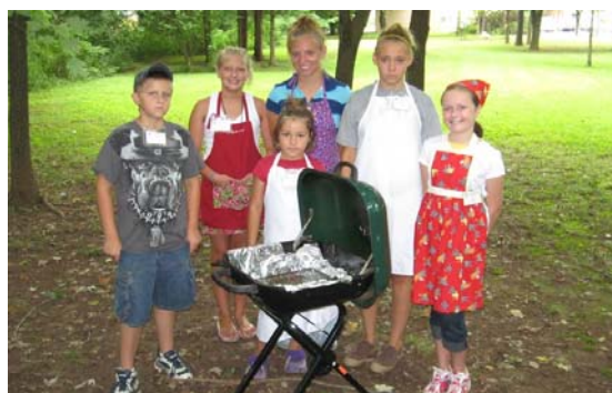
There were six participants in the event—five juniors and one senior.