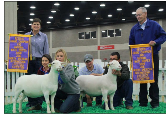
UK White Dorpers named Reserve Champion Ewe and Ram at 2016 NAILE