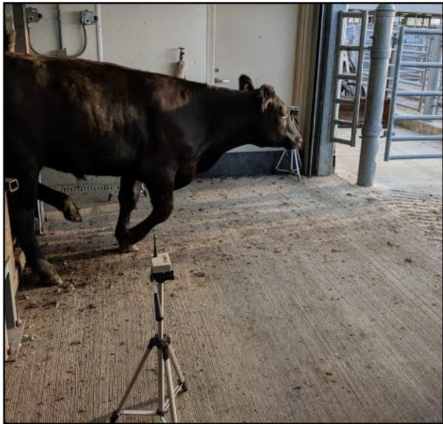
“On the Mark, Get Set, Go.” Researchers at the UK Beef Unit measure “chute exit velocity” to better understand how temperament relates to growth and efficiency in beef cattle.