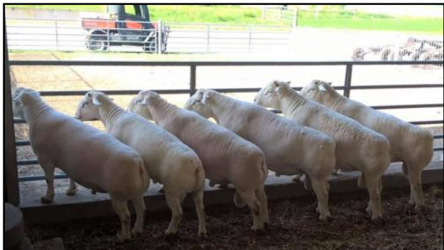
“Baa-dy Builders.” White Dorper rams, all enrolled in the National Sheep Improvement Program, are ready to go to work at the UK Sheep Unit.