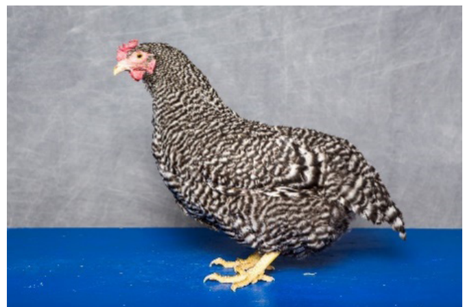
Figure 2. Rhode Island Red rooster (left) and Barred Plymouth Rock hen (right).