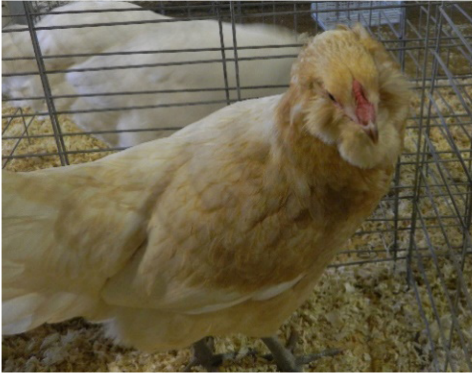
Figure 6. Ameraucana hen (with a tail and muffs and a beard rather than feather tufts).